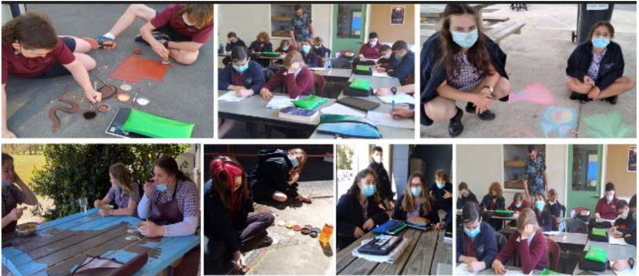
Students have returned to class learning in a covid-safe way. Classes have worked outdoors when possible. Year 12's have sat their October Trial Exams.